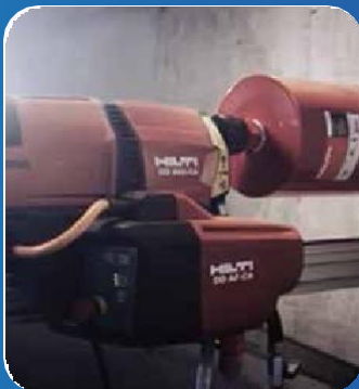
CORE CUTTING WORKS