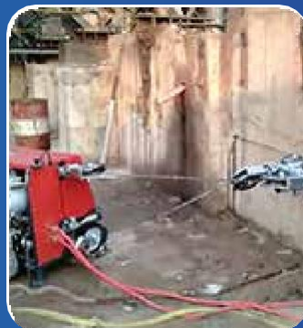
WIRE SAWING WORKS