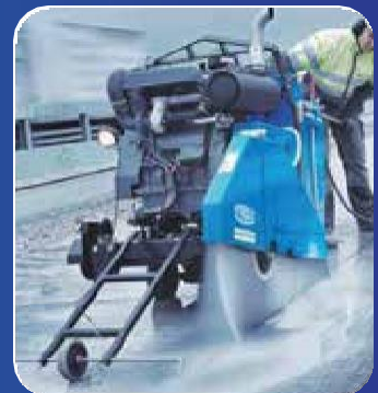
FLOOR SAWING WORKS