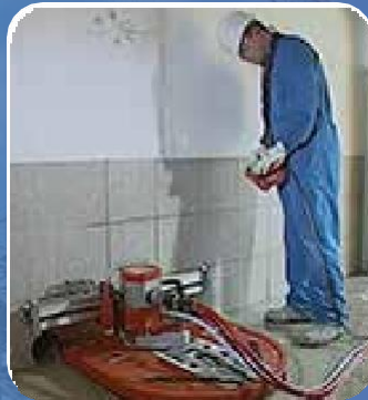
WALL SAWING WORKS