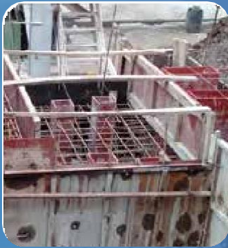
RETRO FITTING WORKS